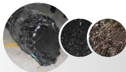
WIRE FRAME PLASTIC COMPOSITE PIPES 钢丝骨架塑料复合管